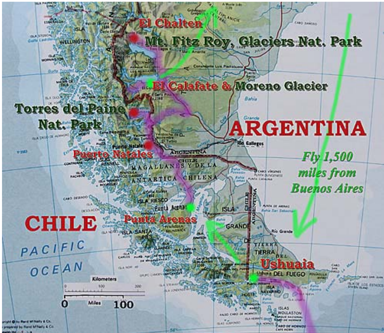
Flights are light-green, and ground transport is purple.

Tip of Patagonia: We flew 1500 miles from Buenos Aires to Ushuaia, Argentina, on Tierra del Fuego Island, where we cruised 12 days round trip through the Beagle Channel and across the rough 400-mile Drake Strait to explore the frozen Antarctic Peninsula. We flew a short hop from Ushuaia to working-class Punta Arenas, Chile, and took vans and buses in Patagonia to visit the nice tourist town of Puerto Natales and the astounding scenery of Torres del Paine National Park in Chile. We bused into Argentina to see bustling tourist town of El Calafate, spectacular Moreno Glacier, fun frontier village of El Chalten, and awesome Mount Fitz Roy. To return, we flew from El Calafate to Buenos Aires, to Seattle.